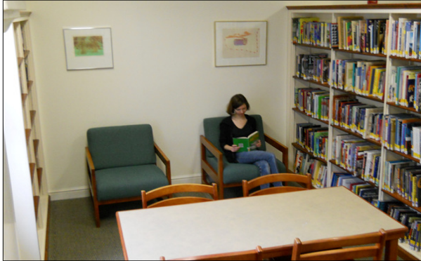
The New Quiet Reading Area & Young Adult Section

It has been an extremely busy summer for the Pawling Library. We could not have done it without the help of contributors and volunteers. Several young men and women volunteered their time to assist in making numerous changes to the library and its collection. They took what should have taken 6 months and finished it in 2. I have been involved in similar projects, some using professional companies, and I have to say that our volunteers did one of the best jobs I have ever seen.